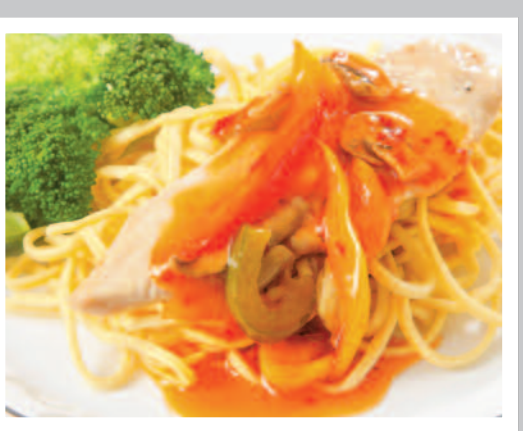
Sweet Chilli Chicken served with Noodles & Seasonal Vegetables