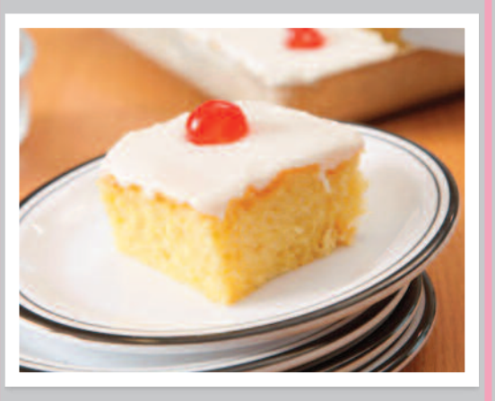
Iced Sponge Cake

Available every day – Unlimited Salad, Freshly Baked Bread, Organic Yoghurt, Fresh Fruit Platter, Milk & Chilled Water.