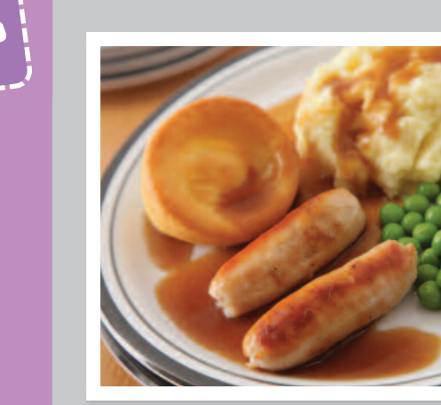
Sausages & Yorkshire Pudding served with Mashed Potato, Seasonal Vegetables & Gravy