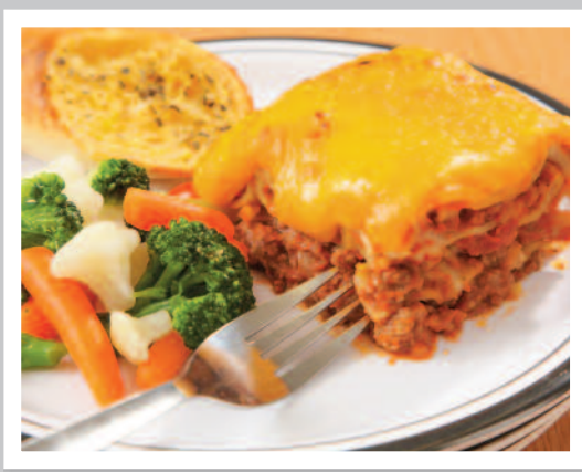
Lasagne served with Garlic Bread & Seasonal Vegetables