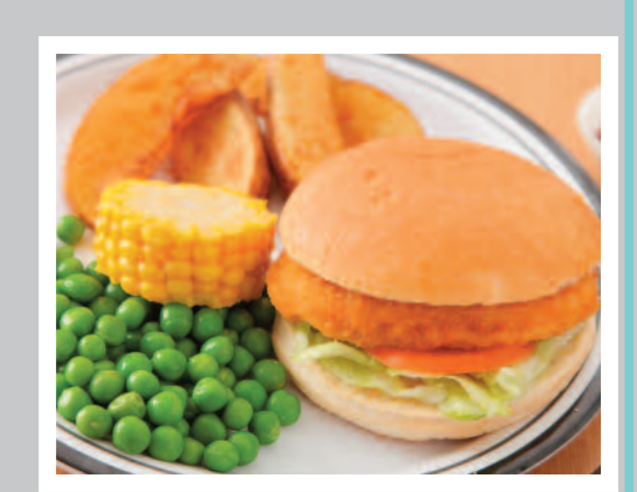
Crispy Chicken Burger served in a Bun with Potato Wedges & Seasonal Vegetables or Baked Beans