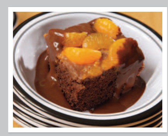
Chocolate Mandarin Sponge & Custard