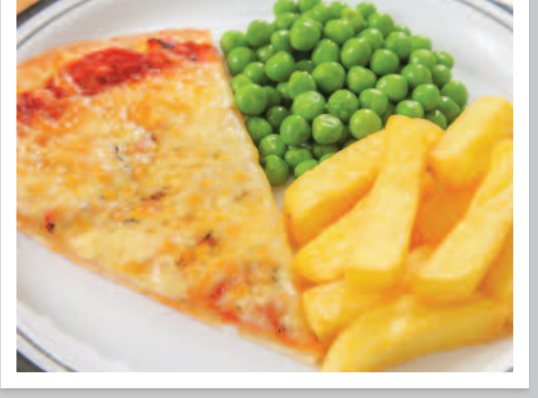
Cheese & Tomato Pizza served with Chips & Peas or Baked Beans